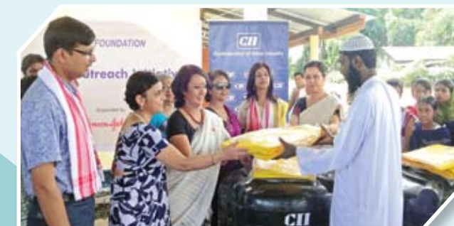
Members of Indian Women Network North Eastern Regional Council at the Flood Outreach Initiative, Assam