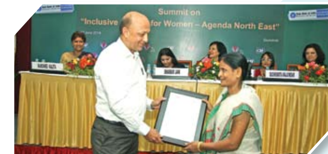
Summit on "Inclusive Growth for Women - Agenda North East"