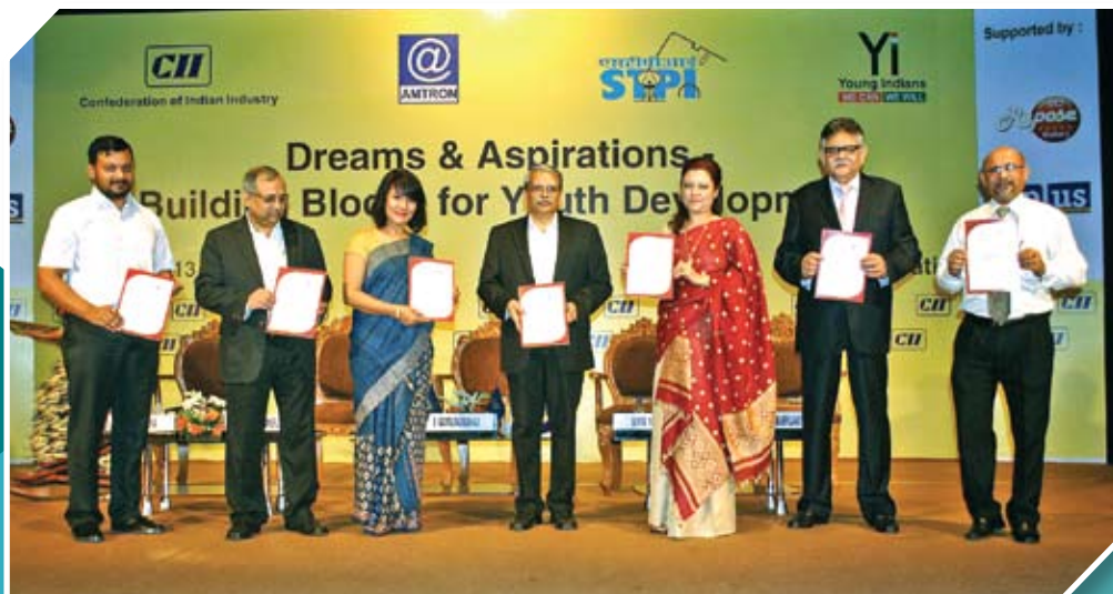
Launch of IWN North East in Guwahati on 24 July 2013